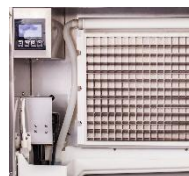
Heavy Duty Nickel Plated Evaporator