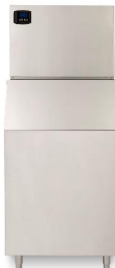
NI370F Shown on NIB580 Bin, Sold Separately