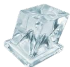
FULL DICE CUBE 2.2 x 2.2 x 2.2 cm 7/8 x 7/8 x 7/8 in