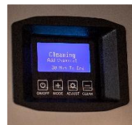
Advanced Controller with Auto Clean and Diagnostics