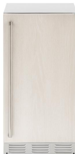
Shown with custom wood overlay panel (not included)