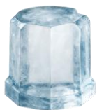
GOURMET CUBE 3.2 x 3.2 x 3.2 CM 1.25 x 1.25 x 1.25 IN